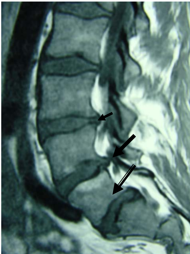
Figure 4. Here is the sagittal image showing the L3-L4 disc protrusion (small arrow) and the L4-L5 disc extrusions and free fragment. (large arrow) The transitional segment is at the double arrow.