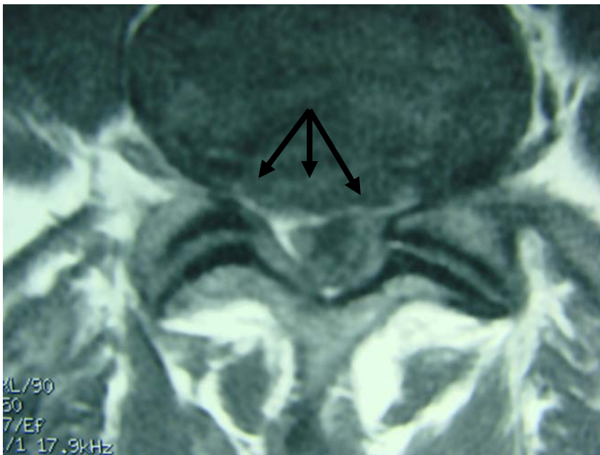
Figure 2. This is the axial image showing the extensive right sided and central large disc extrusion from the L4-L5 disc level (see arrow) that extends from central to the right lateral recess to stenose the vertebral and osseoligamentous canal. This axial image is posterior to the L4-L5 intervertebral disc space. This is capable of compressing the right L5 nerve root within the lateral recess as well as the cauda equina containing the sacral nerve roots within the cauda equina.